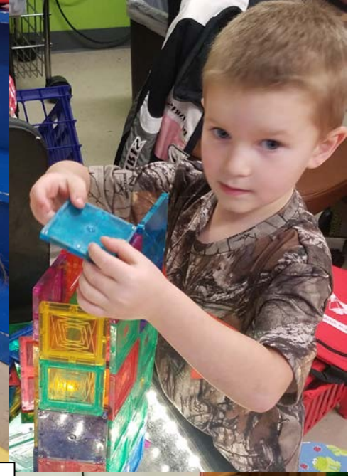
School Readiness at ACGC 2017